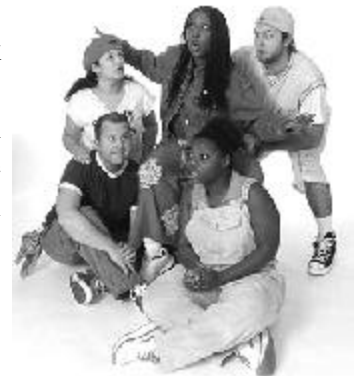
Touring Theater Ensemble

The picnic lasts from 12 to 3 pm. Bring a picnic lunch, and enjoy a family celebration with music, storytellers and the opportunity for you to read your favorite poem. For more information, visit www.poetrygso.org or call Beth Sheffield at 373-3617. (Rain location: Central Library)